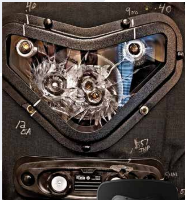
RCX1 24" x 48" Shown with Optional VENGEANCE™ Viewport and FoxFury B70 1200 Lumen LED