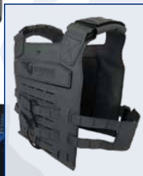
VADER-X3 BACK VIEW Shown with Optional High Rise Cummerbund