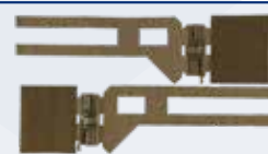
HIGH RISE CUMMERBUND Optional Feature

CONTACT: (T) 844.556.M855 • (Email) info@blueridgearmor.com INFORMATION: www.blueridgearmor.com