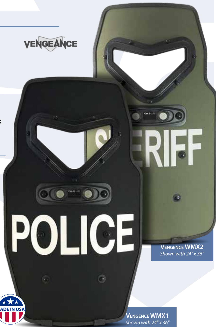
VENGEANCE WMX2 Shown with 24" x 36"